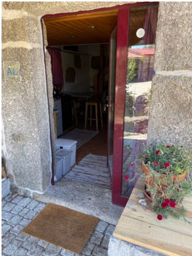
Front door from the outside

The front door leads to the kitchen/living room/bathroom (all with level tiled access)