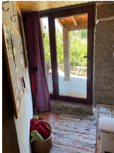
Front door from the inside

There is a small step down to the shower area - There will be a ramp access for wheelchairs from April 2023.